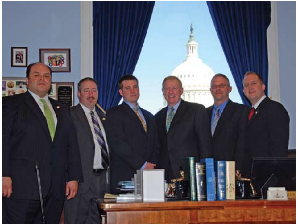
Congressman Dan Burton meets with the delegation from Hamilton County Local 4416 during the IAFF Legislative Conference.

I will relish the day when Valpo Local 1124 is no longer the leader in state PAC contributions. So please get your members on board, get yourself on board if you are Union Leadership, and let's ALL work together to make this great tool even better!