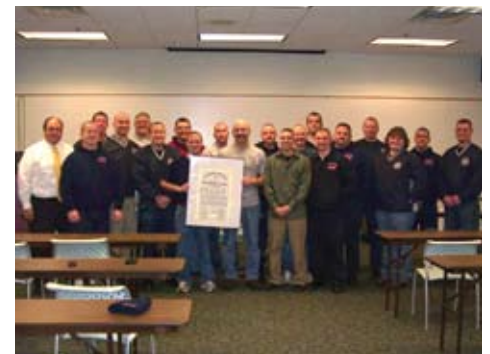
Members from Hancock County Local 4787 at their union meeting posing with their charter issued January 1, 2010. Departments in the local: Sugar Creek Twp. and Buck Creek Twp.