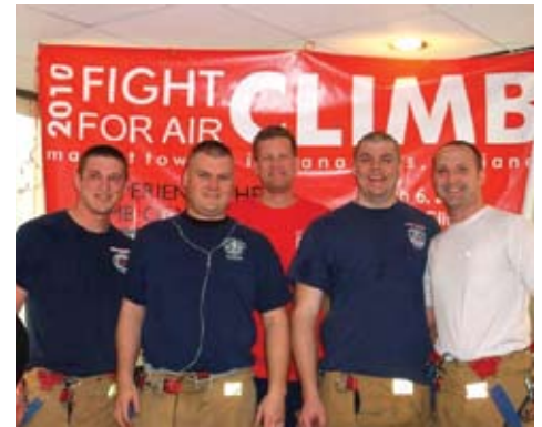
Five members from Local 4416 Westfield took part in the American Lung Association's "Fight for Air Climb" to raise donations and awareness for the mission of the association. The charity event took place at the Market Tower in Indianapolis where each participant climbed the 30 story building in full firefighter turn out.