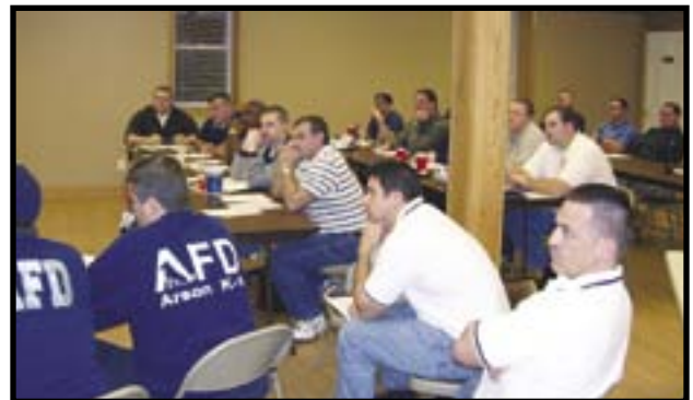
The 2nd District Meeting, hosted by Hamilton County Local 4416.