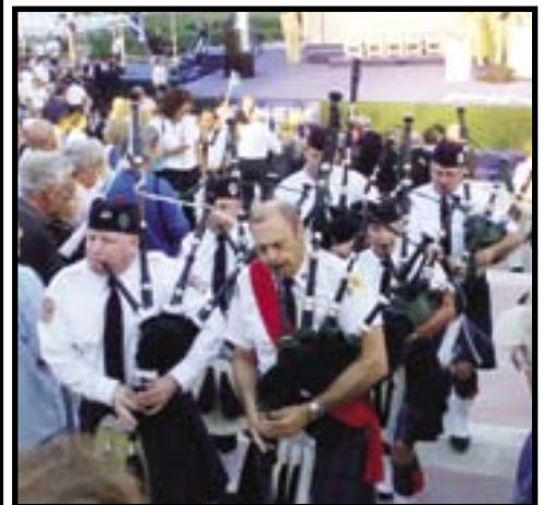
Above Left and Right: Indianapolis Emerald Society Pipes & Drums lead in the US and European teams for the Solheim Cup.