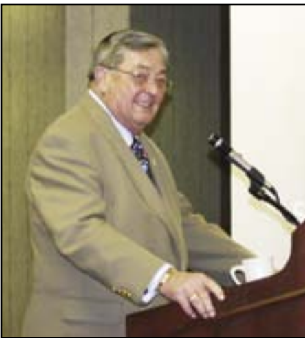
Senator Larry Lutz, retired Evansville Firefighter, addresses the 2006 PFFUI Legislative Conference.