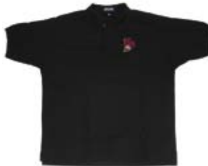
FIREPAC Polo shirt