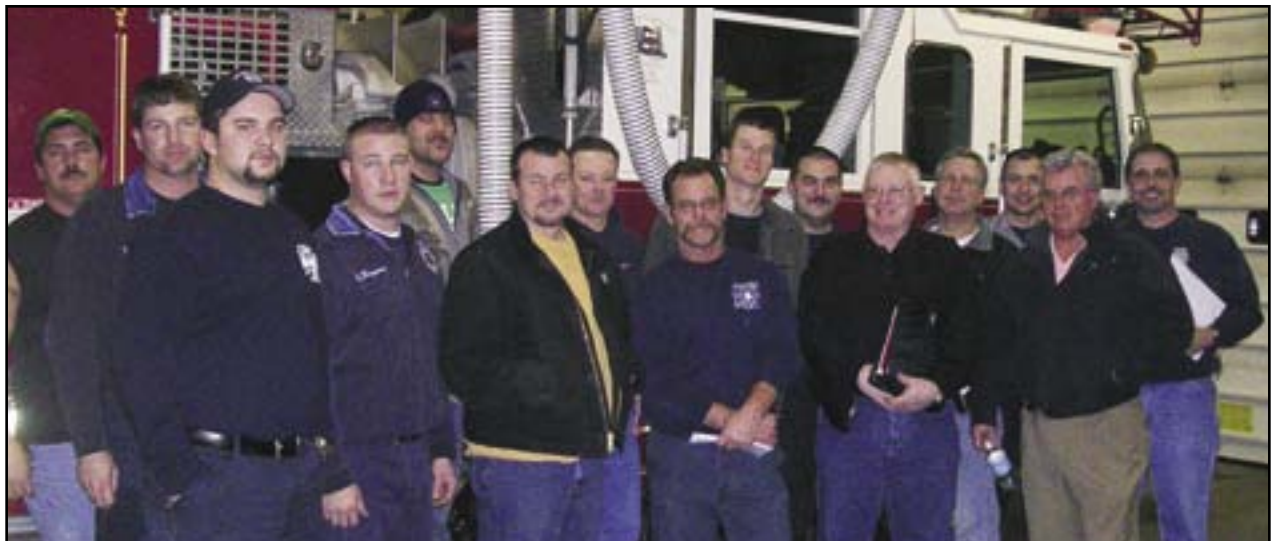
Marion Firefighters pose for a picture after a meeting.